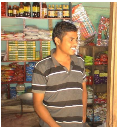
Figure 4: Dharendra Behra paid 30% interest on a loan taken from

Lack of infrastructure and higher level of education and skills will hinder the growth of rural nonfarm sector. The expansion of roads, transport, communication and buildings will not only offer nonfarm jobs to people but will give means to survive in the future. The rural enterprises can readily obtain materials and market them in the urban centres to earn profits. However, this will not be possible if the government of the transitional economies do not actively participate in the rural development activities.