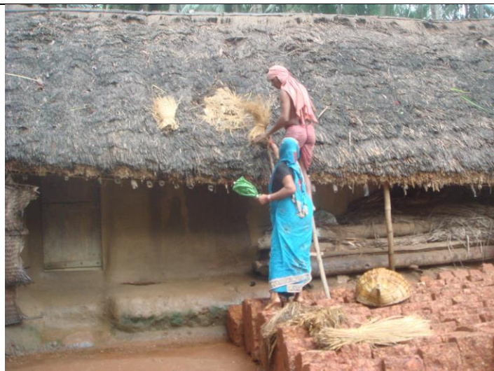
Villagers stocking dry hay to project their homes.

Diversification of economic activities has led to a visible structural shift from an agriculture based economy to an industry-led and service-led economy in Odisha 1 . Growth of RNF sector is critical for growth and poverty alleviation in Odisha post cyclone Phailin . It will make rural communities more adaptable and resilient to frequent natural disasters. Equitable growth of RNF sector will not be automatic; a lot will depend upon government policies and regulatory authorities to push the growth in right direction. Development of the informal sector by integrating it into the mainstream economy, and making this sector demand-induced, will generate adequate employment opportunities, ensuring sustainable livelihood to significant numbers.