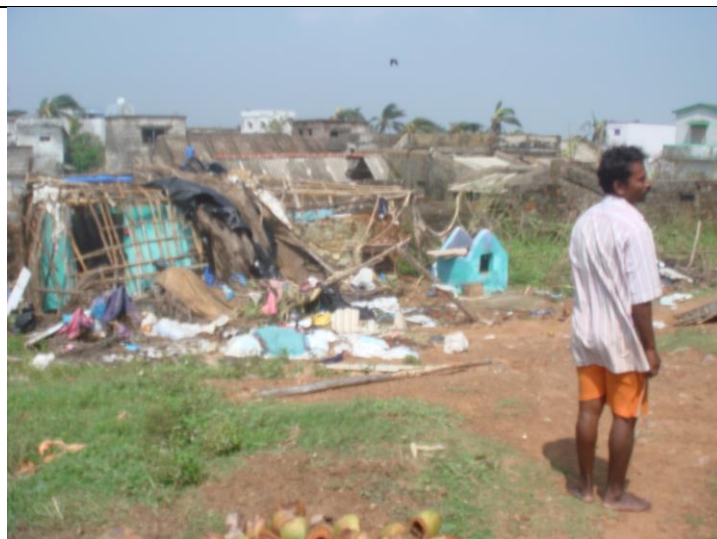
Victim looking at his destroyed house in Ganjam, Odisha