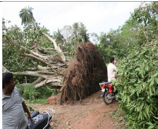
Trees uprooted due to strong cyclonic winds