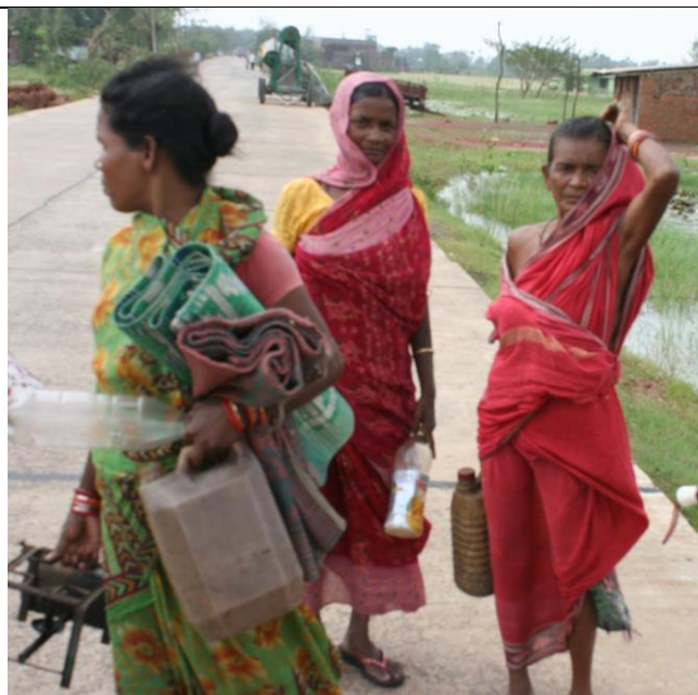
Communities returning from cyclone shelters in Puri district.

From policy point of view, there is a high need to cover nonfarm livelihoods in loss and damage assessment for not only supporting affected people but will accurately assess the impact of any climate related disasters. Cyclone Phailin and the post cyclonic floods reflected the need to study the impacts of nonfarm livelihood programmes and how it benefits and challenges Cyclone Phailin and post cyclone floods, reflects the need to conduct the study the impact of nonfarm livelihood programmes - benefits and challenges (how fast is their recovery when compared with farm livelihoods; and how stable is it to deal with climate uncertainty).