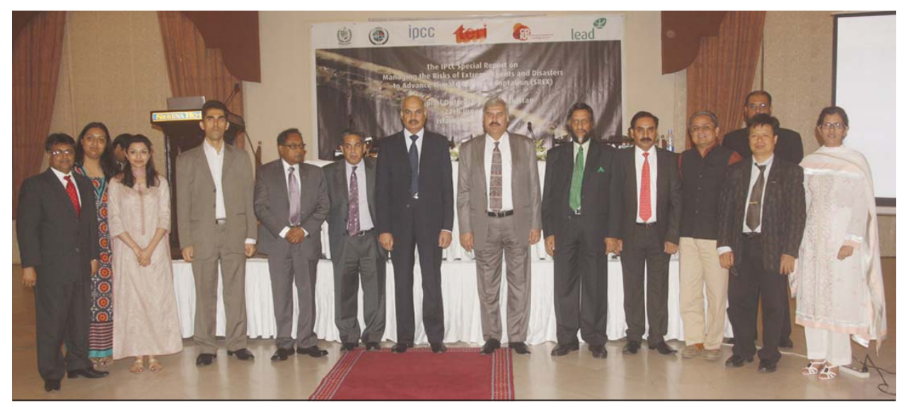
One of the follow-up actions at the Delhi regional launch of SREX report of IPCC was to support other similar national launches. The national outreach event was organised in Islamabad, Pakistan on June 27, 2012.