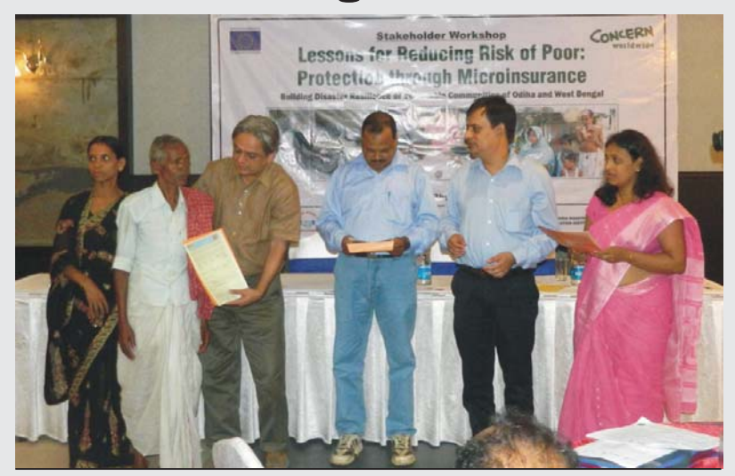
Launch of insurance policies for poor and vulnerable coastal communities in Odisha.

T he poor are the most vulnerable to risks; the majority of them have to manage risks with their own means. Very few have access to formal insurance and depend on informal mechanisms to cope with shocks. During the last ten years, formal insurers have started targeting low-income markets. Recently new forms of micro-insurance have been developed which aim to mitigate the risk of natural disasters for the poor. Humanitarian and government agencies are looking at these new models with growing interest, especially as climate change may pose new challenges by further eroding actual coping mechanisms.