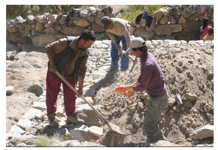
It needs to promote community-based adaptation principles and develop; adopt and test tools; and techniques for adaptation.