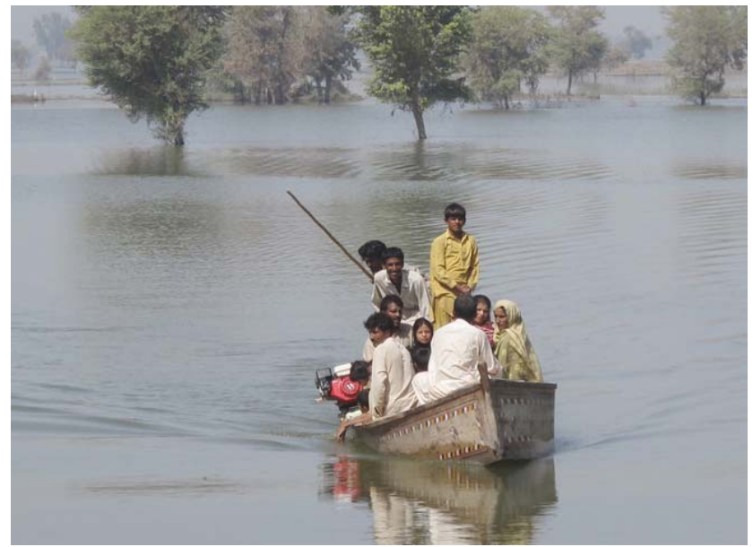
Climate change is set to have an impact on every aspect of humanitarian and development work. It is therefore critical that those engaged in managing disaster risk mainstream climate change adaptation.

Firstly, the communities of 'development', 'climate change' and 'disasters' still work in relative isolation. In Government, there are separate ministries and departments each of which are developing their own plans and policies. Civil society, donors and academia encourage this by identifying themselves within one or other of these 'sectors' and talking