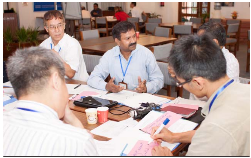
Discussions in progress on planning and adapting Disaster Risk Reduction for the Kosi Basin.

The Intergovernmental Panel on Climate Change (IPCC) which was established by the UNEP and WMO, has along with the UNFCCC generated great awareness and renewed understanding of the between climate change, the environment and disaster management. Presently, not only in Europe or the Americas, but also in