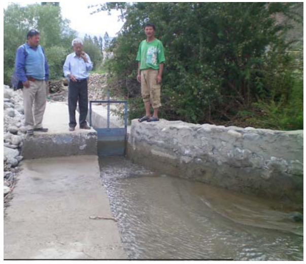
have no other Participatory planning process of rebuilding local alternative land, infrastructure is in progress.

Broken Canal can Create water disputes during the disaster recovery. However, the farmers were ready to provide as much labour support as